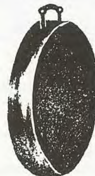
FOG GONG G-950

2-1/4" Wide 16-3/16" Dia. Plated Steel with Rawhide Mallet.