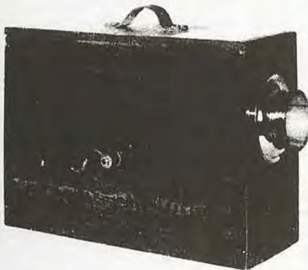
PORTABLE MECHANICAL FOGHORN - Rotary Type

Portable Mechanical Foghorn as required by the U. S. Coast Guard. Heavily constructed wooden box; heavy brass horn and handle. Produces a sound which can be heard many miles away. Simple to operate; always ready for use. 21-1/2" long, 8" wide, 14-3/4" high. Weight: 23 lbs.