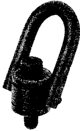
HR-125 UNC THREADED