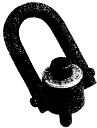
HR-125M METRIC THREADED