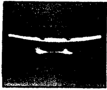
Fig. 92HX Boat Cleats Open Base Galvanized Malleable Iron (Mount With (2) Finished Hex Head Bolts)