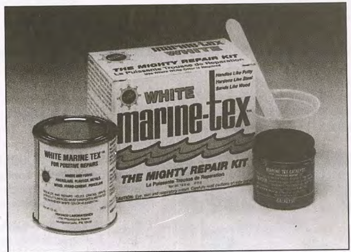
ABS Certification #96-PAJ8284-X

Tough, versatile, structural epoxy. For fiberglass lay-ups and repairs to wood, aluminum, fiberglass and steel. Stand-alone use for thin-line bonding. Armor-like resistance to abuse. Provides watertight protective coating for tanks and holds.